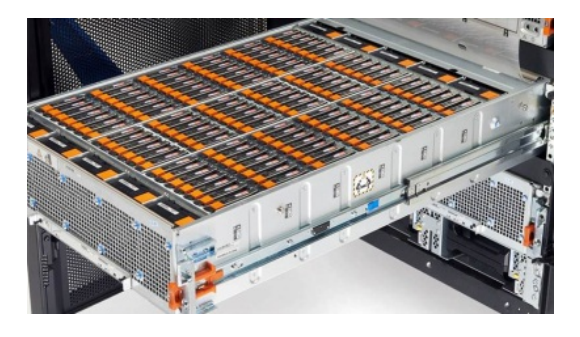
Up to 120 Drives per Shelf

The VMAX3 family introduces unmatched breakthroughs in performance density and packaging designed to reduce costs and fit all of your data center needs. VMAX3 arrays can store up to 720 high-density drives and deliver a complete VMAX3 engine on a single floor tile—that's an industry first of up to 1.7M IOPS in a single rack.